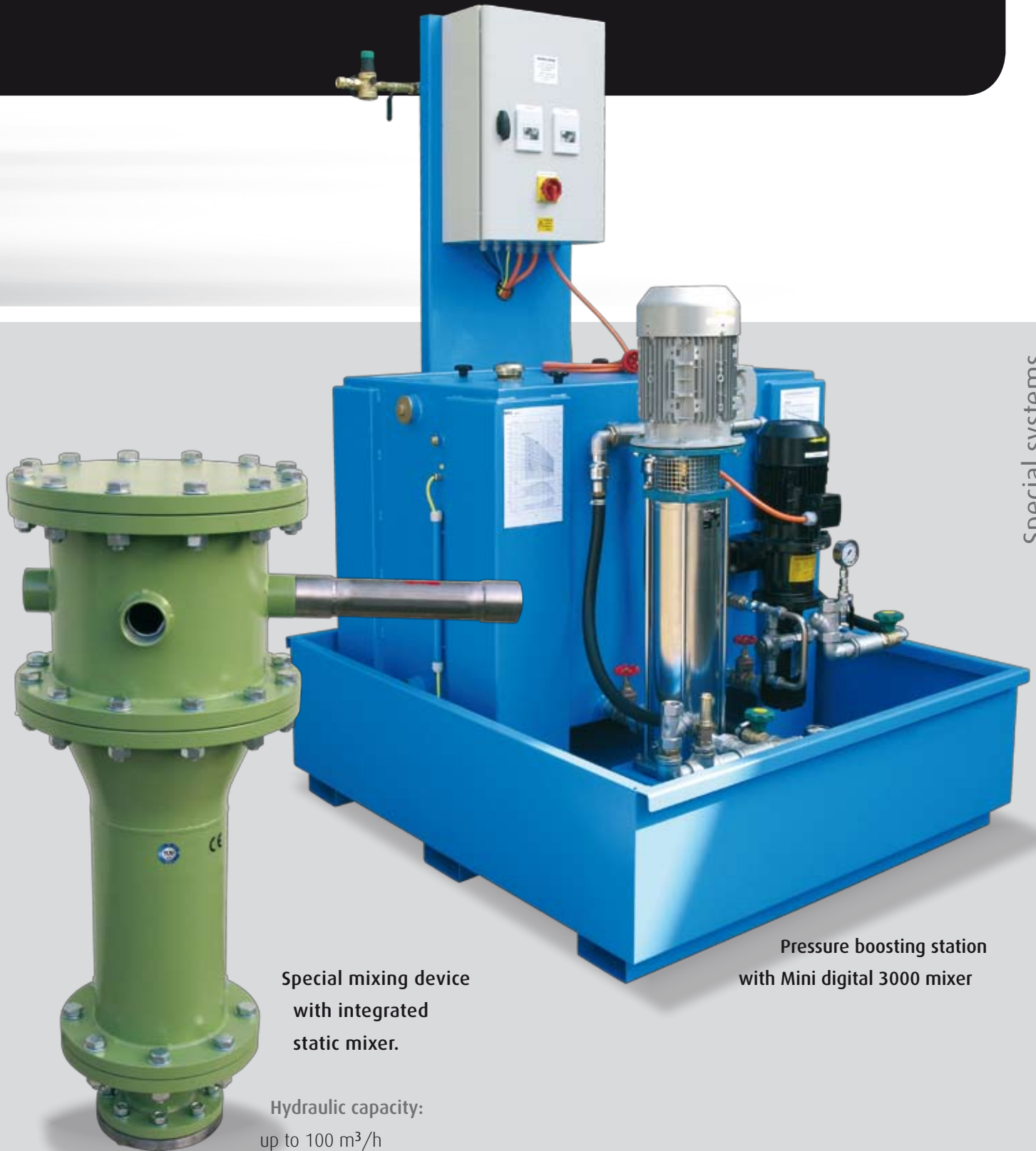
Special mixing device with integrated static mixer.